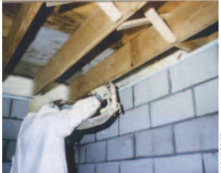
Figure 4. Rim joists are difficult to insulate and nearly impossible to fully seal with traditional insulation and vapor barriers. Foam allows you to do a much better job insulating areas that are often poorly done.

popular choice for sealing and insulating the perimeter walls of crawlspaces, especially in areas where unvented crawlspaces are permitted by code.