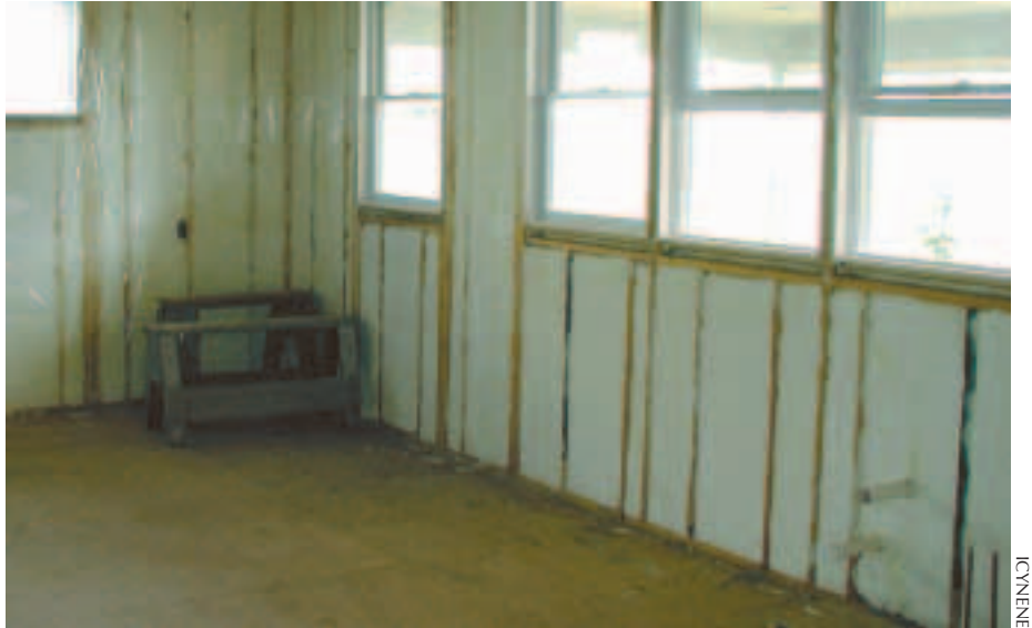
Figure 2. Open-cell foam is more permeable to vapor than closed-cell material. All foam is designed to be used without a vapor barrier, but some inspectors will make you use it, as in this kitchen that was insulated with 1/2-pound foam.

Cold roofs and foam. One way to deal with these sorts of troublesome leaks is to fill the ceiling with spray foam. According to Matt Momper —