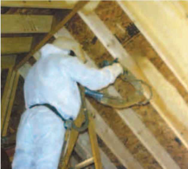
Figure 3. Spray-applied foam insulation allows you to build cathedral ceilings without venting or vapor barriers. It also allows you to build unvented attics.