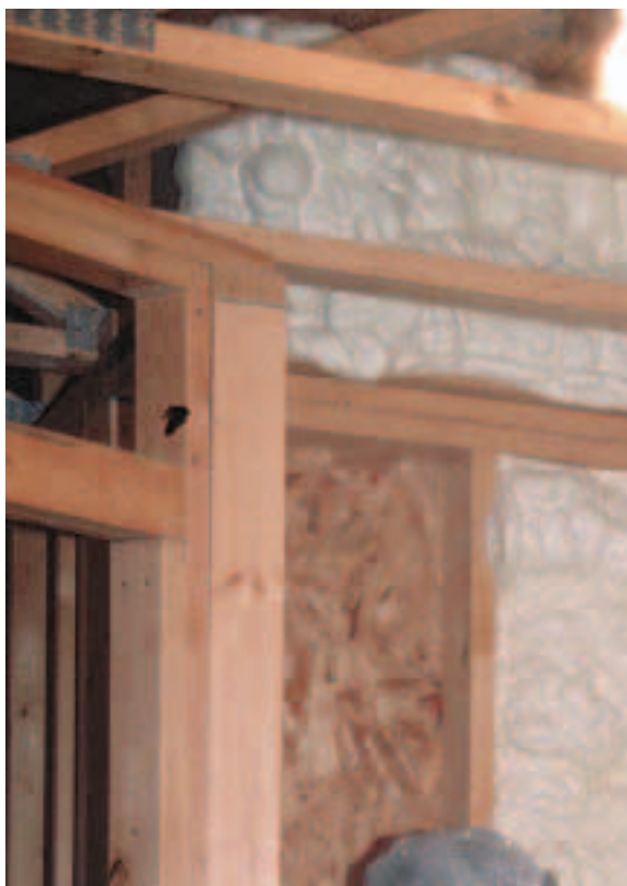
NORTH CAROLINA FOAM INDUSTRIES

A denser, 1.8-pound foam, on the other hand, has an R-value of about 7.